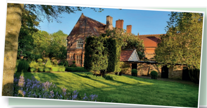
Besthorpe Hall

Visit to the garden at Besthorpe Hall, Attleborough, NR17 2LJ.