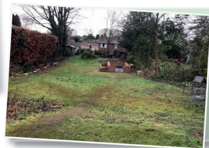
February 2020 photo Barbara Williams.

The base of a greenhouse went up just before the first lockdown.