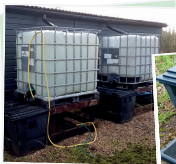
Water conservation in action

Personally, I much prefer to scoop water into a watering can rather than waiting for the can to fill from a water butt tap – I am too impatient! We invested in a couple of Intermediate Bulk Containers (IBCs, below left) which each hold 1,000 litres; we then made a couple of raised bases from salvaged wood from the demolition exercise to raise them up. A local pub was replacing their water tanks in the loft and the old plastic header tanks (below right,) each holding about 200 litres, were destined for waste. We patched up the holes and we then had four 'scooping tanks'. Two are placed beneath the IBCs and two positioned by a flower bed and we top these up with a pump. Bargain!