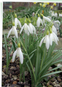
Galanthus nivalis 'Norfolk Blonde'

The base of a greenhouse went up just before the first lockdown.