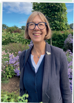
The Editor

But it is the nature of plant lovers and gardeners to make things work and somehow it has begun to come together over time. Clearing as much as possible and removing dead stumps and weed trees took priority. And buying plants, any plants and as many as possible, initially just to give us the feel of a garden. One of the early delights we bought was at an NPH talk – Galanthus nivalis 'Norfolk Blonde'.