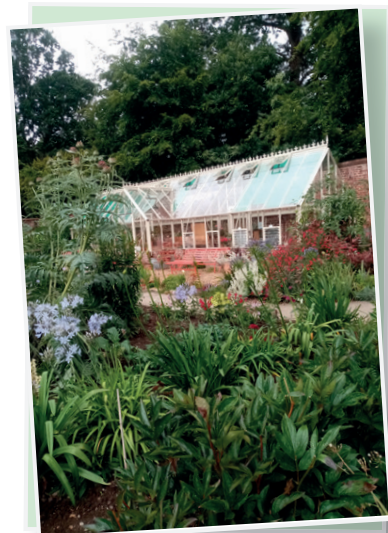
Little Plumstead Walled Garden

As ever, I look forward to seeing you over the coming months.